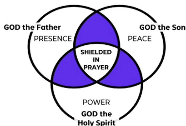
The Holy Trinity

As intercessors dip their prayer buckets into the well of all God is and all He has promised, pouring these truths over the leader's walk with God, they shield our spiritual leaders, encasing them in the Presence, Peace and Power of all the LORD God Almighty is.